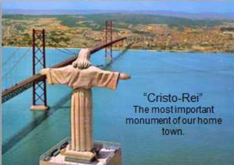
"Cristo-Rei" The most important monument of our home town.